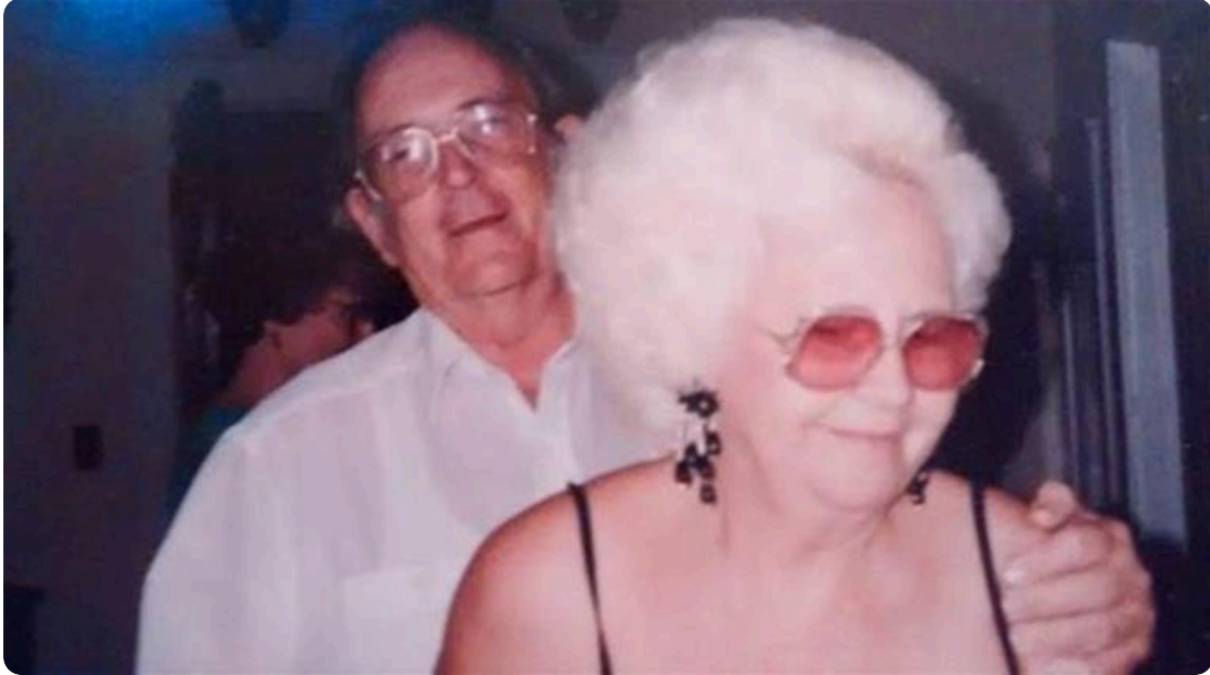
Mom and dad goofing off in the kitchen again!