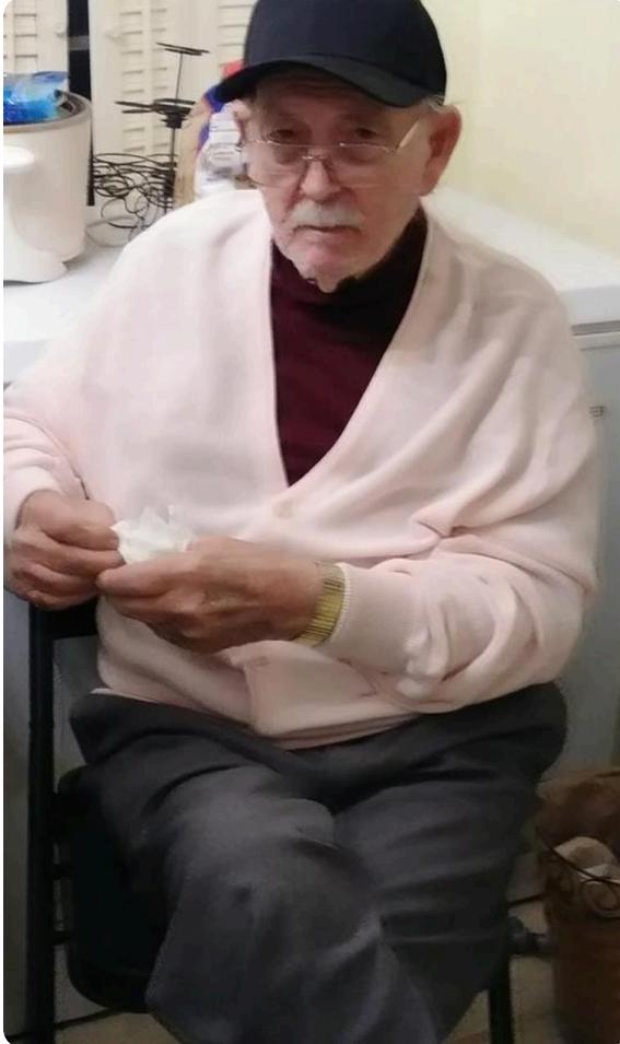
HL watching the women working - 2017